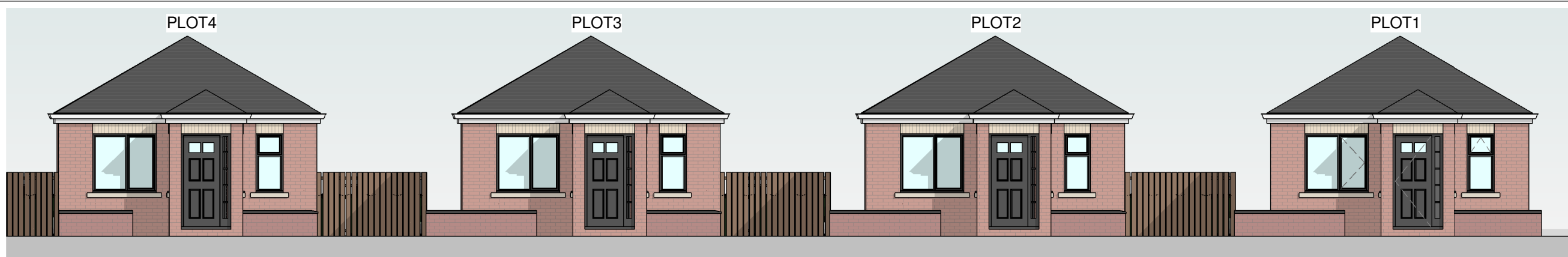
1 Proposed East Elevation 1 : 100