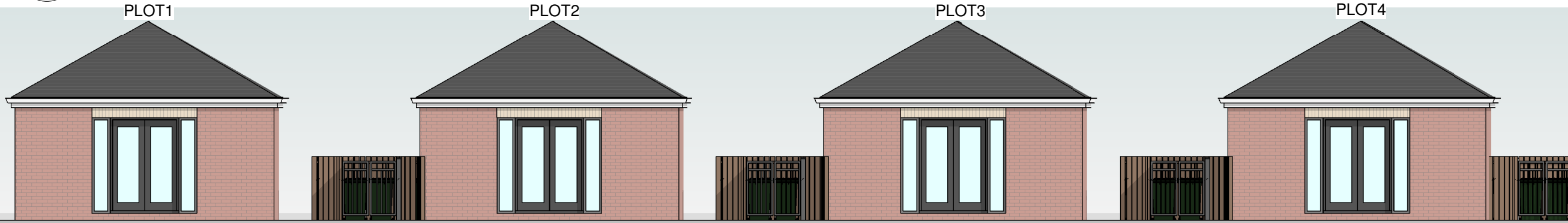
4 Proposed West Elevation 1 : 100